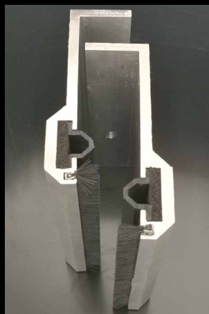
Weather stripping and curtain support angles.